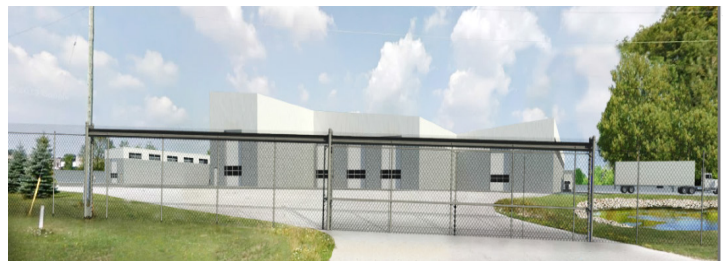
Rendering of the ION Operations, Maintenance and Storage Facility (view from Dutton) to be completed by 2017.